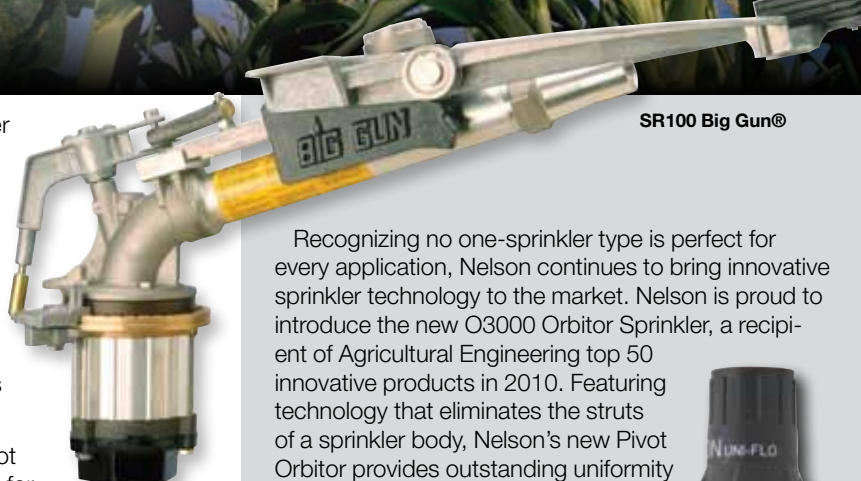
SR100 Big Gun®

Nelson Irrigation Corporation is headquartered in Walla Walla, WA USA. The company’s focus is on improving the state-of-the-art of agricultural irrigation. Visit us at: www.nelsonirrigation.com